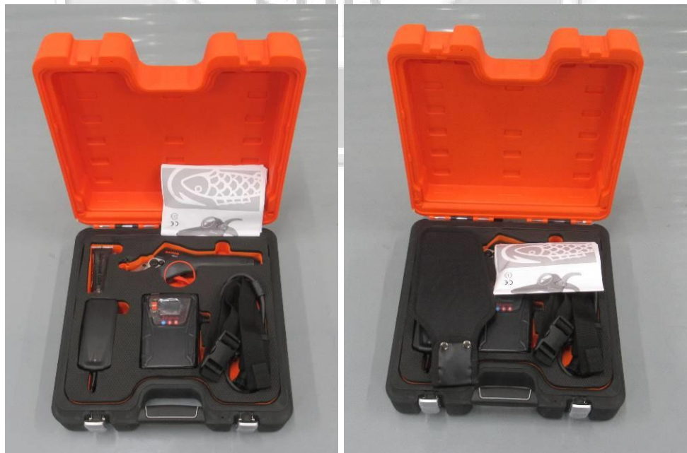
Photo of Inner layout