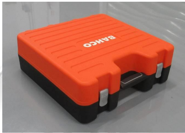
Photo of Test Sample